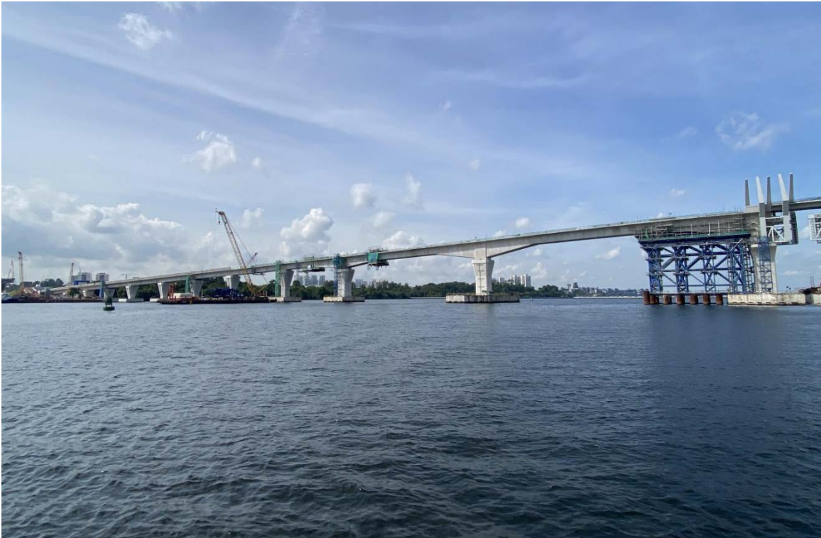
Marine Viaduct Segmental Box Girders fully launched