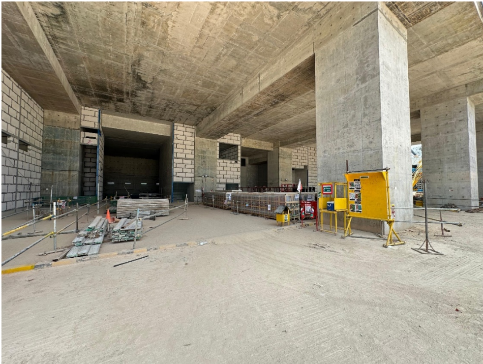
Ticketing Concourse Back of House Civil Structures