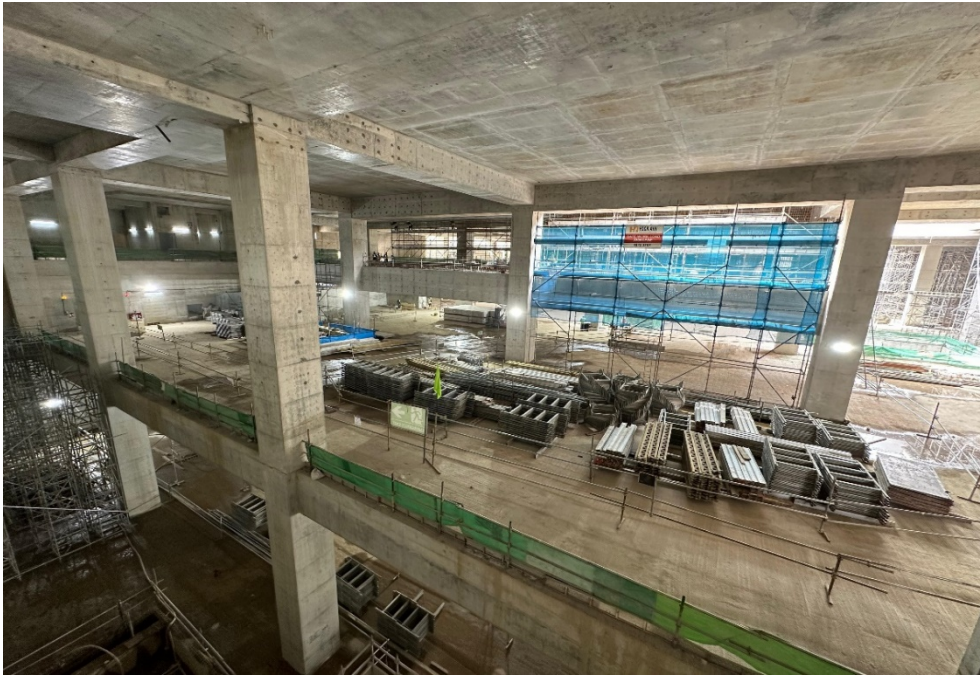
Station Basement 1 and Basement 1 Mezzanine Civil Structures