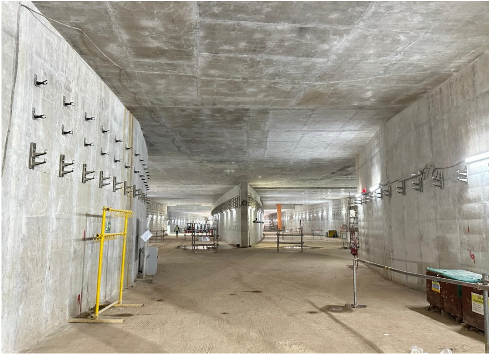
Running Tunnels Box